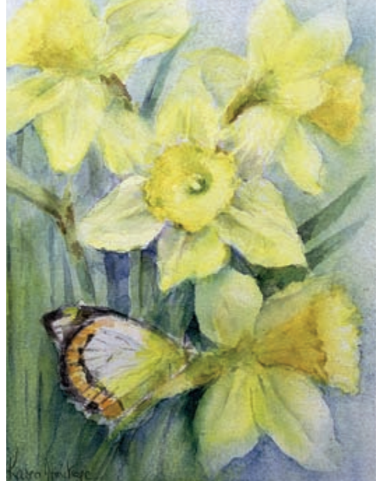
Butterfly on Daffodils , Karen Armitage. Watercolor. Private collection.

I wandered lonely as a cloud That floats on high o'er vales and hills, When all at once I saw a crowd, A host, of golden daffodils; 5 Beside the lake, beneath the trees, Fluttering and dancing in the breeze.