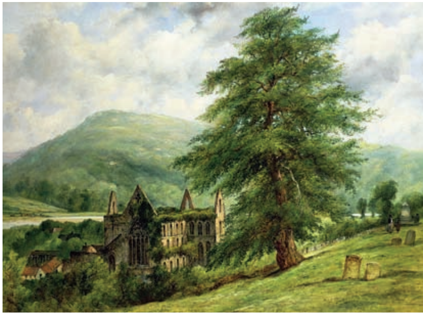
Tintern Abbey (1800s), Frederick Waters Watts. Private collection.

And mountains; and of all that we behold 105 From this green earth; of all the mighty world Of eye, and ear—both what they half create, And what perceive; well pleased to recognize In nature and the language of the sense The anchor of my purest thoughts, the nurse, 110 The guide, the guardian of my heart, and soul Of all my moral being.