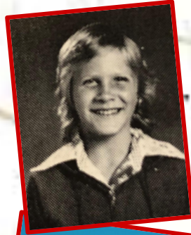
This is me in 4th Grade!

I'm looking forward to learning and growing with you!