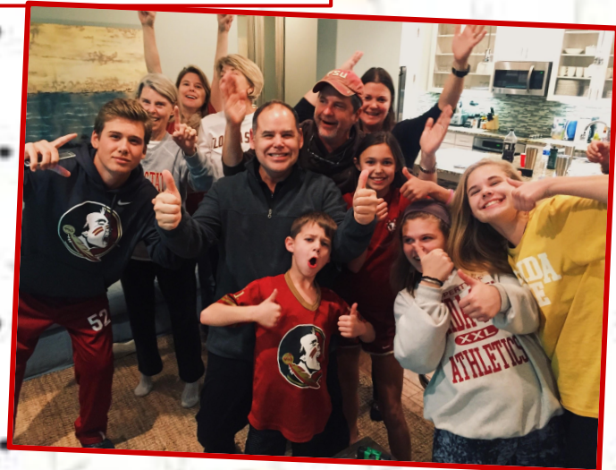
Our whole family of Seminole fans!