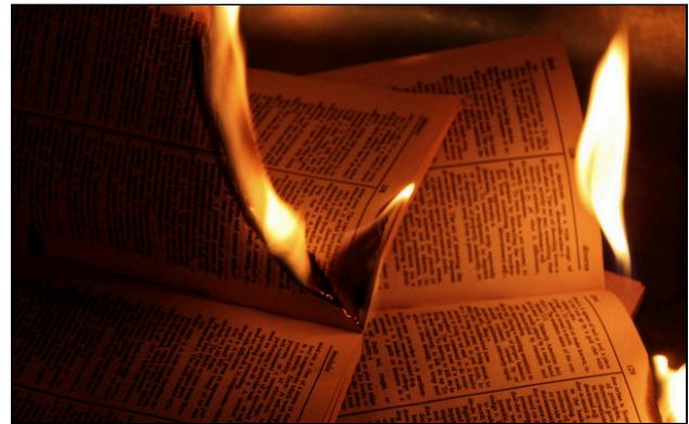
"Burning Books Page1"

Certain members of your community have suggested that my work is evil. This is extraordinarily insulting to me. The news from Drake indicates to me that books and writers are very unreal to you people. I am writing this letter to let you know how real I am.