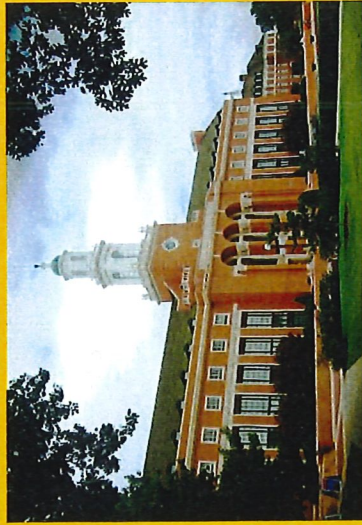
Oklahoma State University

“Hagan Scholar Testimonials” can be found on the HSF website, under the Scholarship Information Link.