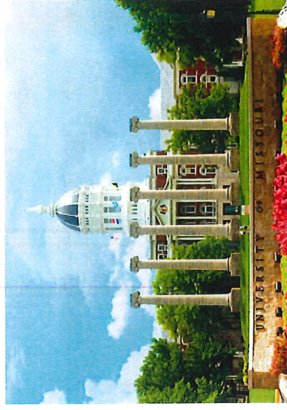
University of Missouri-Columbia

Free workshops, Free Brokerage Accounts, and Free Study Abroad provide recipients with a practical understanding of important life skills not typically covered in the school curriculum. Hagan Scholars have attended 482 colleges and universities located in 48 states.