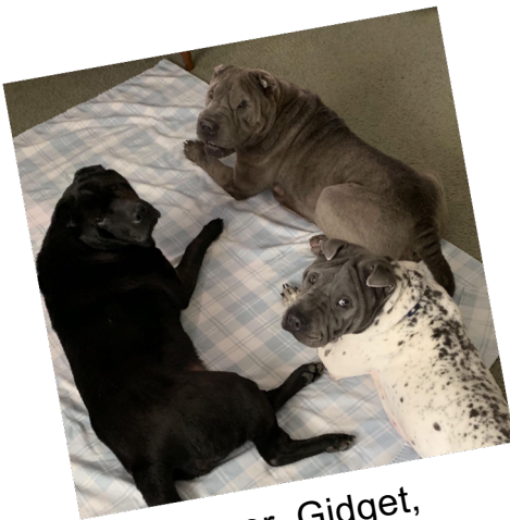
Pepper, Gidget, and Tatertot