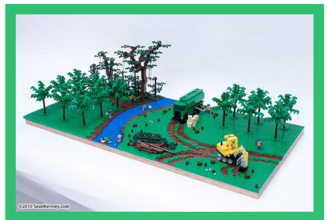
Lego Rainforest Diorama