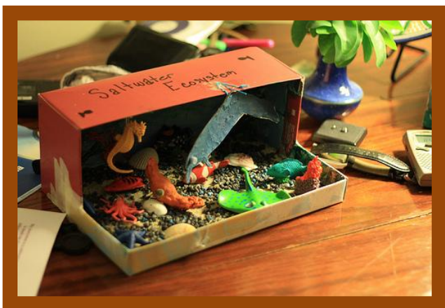
Saltwater Ecosystem Diorama