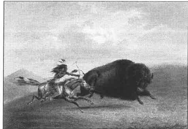
"Buffalo Hunt" by George Catlin is in the public domain.