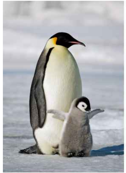
Emperor Penguin with Chick

A mother Emperor penguin lays only one egg at a time. After the mother Emperor penguin lays the egg she travels to open sea to feed on fish, squid and krill (shrimp-like ocean crustaceans). The father stays behind with the egg. He keeps it warm and protected by balancing it on his feet and covering it with feathered skin called a brood pouch. The mother returns two months later, regurgitates food for the newly hatched chick, then stays with it while the father goes out to sea to feed.