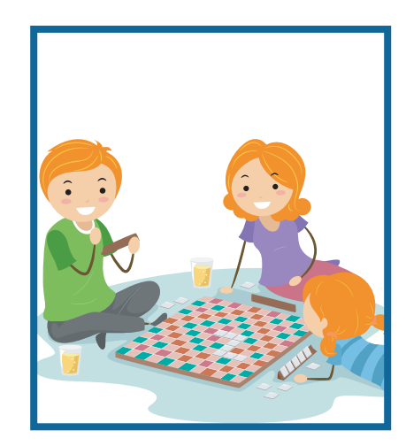
Family Game Time