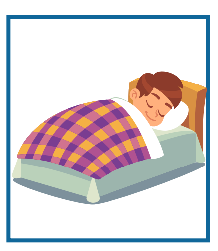
Go to Sleep