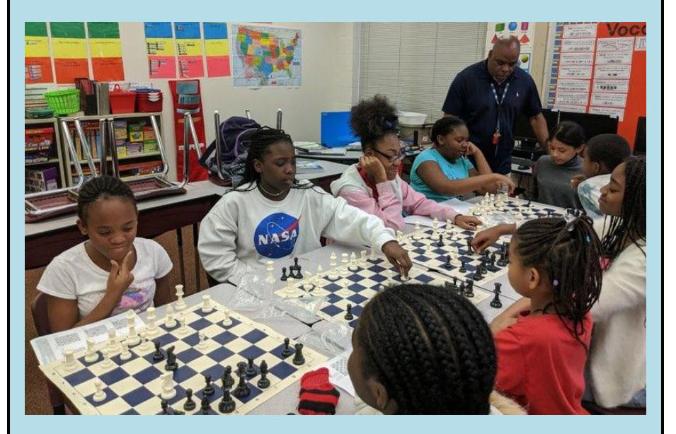
Students are focused on the game at Riley

Checkmates is an educational series dedicated to building reading, math and science skills, self-esteem, cultural enrichment, creativity and problem-solving. This program is being piloted at Springwood and Riley Elementary schools. The students are honing their skills for a tournament in the spring.