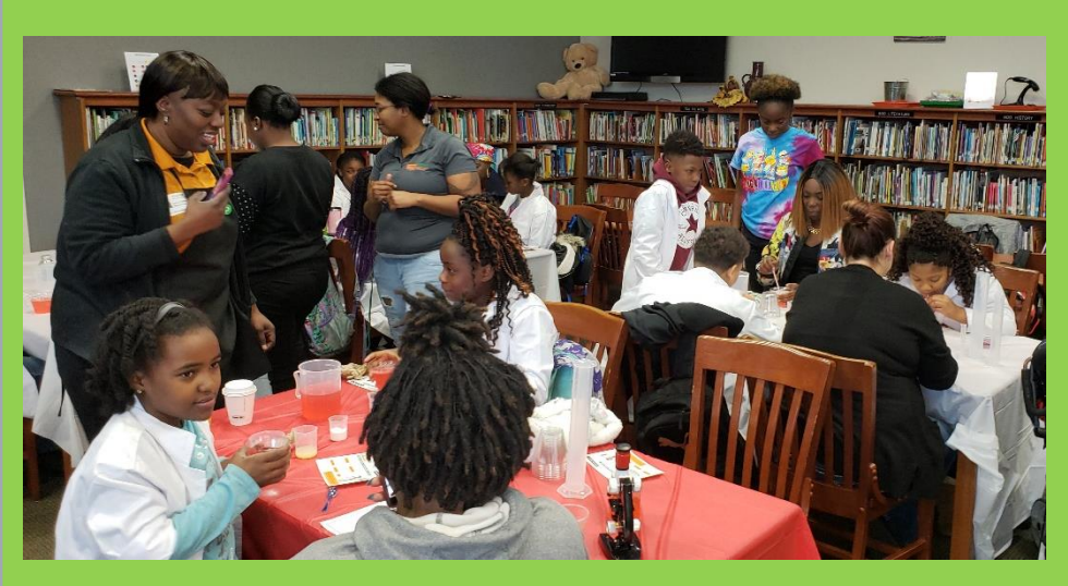
Riley Elementary School