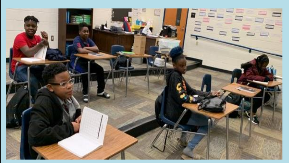
Griffin students are preparing for Trial Competition

The new Middle School STEM Series, Prove Us Wrong, is an educational series dedicated to research, investigation, public speaking, and learning about case law and sciences. Participating students will have the opportunity to explore science, civics, math, and language arts concepts through hands-on activities involving a unique class action lawsuit created specifically to represent aspects of science, technology, engineering, and mathematics. Competitions amongst the four middle schools—Ft. Braden, Tallahassee School of Math & Sciences, Nims, and Griffin—will be held to simulate a formal court proceeding. We wish all of our participating schools the best of luck as we approach the trial date.