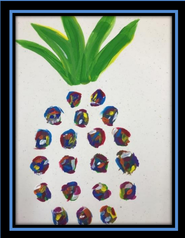
Monica - 10 th grade