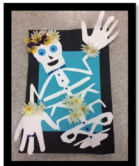
Roana - 3 rd grade