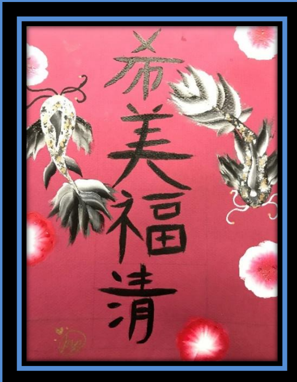
Grace - 10 th grade