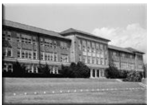
Library along Park Avenue.

Leon is Florida's oldest continually accredited high school, founded in 1871 just twenty-six years after Florida became a state. It was five years later when a two-story building was erected on the present-day site of the Hobbs Federal Building along Tennessee Street. This facility was used until a new building was erected in 1911. That structure was located on the current site of the Leon County Public