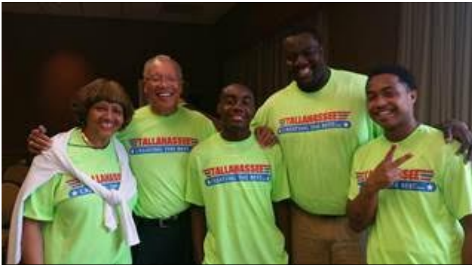
Tallahassee an ALL AMERICA CITY — AGAIN!!! 50 LARGE helps to make the case