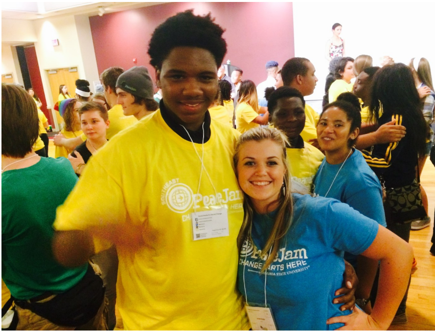
50 LARGE and PeaceJam make a great team!