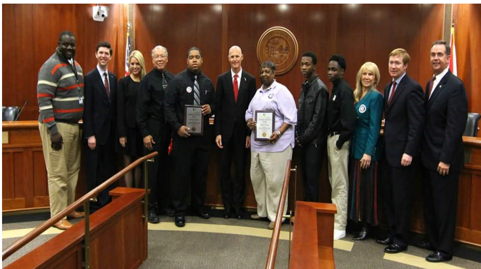
AmeriCorps Tutors honored at the Capitol for work with 50 LARGE clients.

The percentage of participants who participated in at least 8 50 LARGE leadership sessions who were promoted to the next grade level.